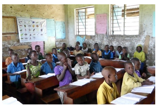
Kakooga Primary 1 students