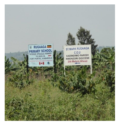
Signpost for Rugaaga Primary School