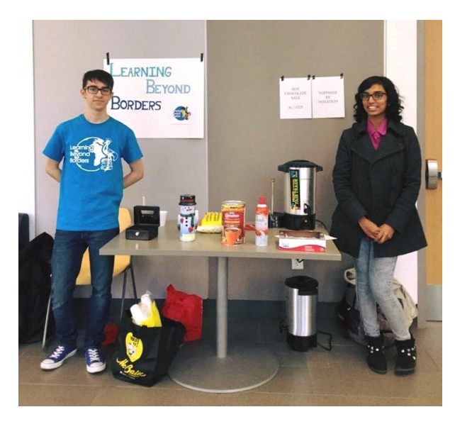
LBB University of Alberta Hot Chocolate Sale