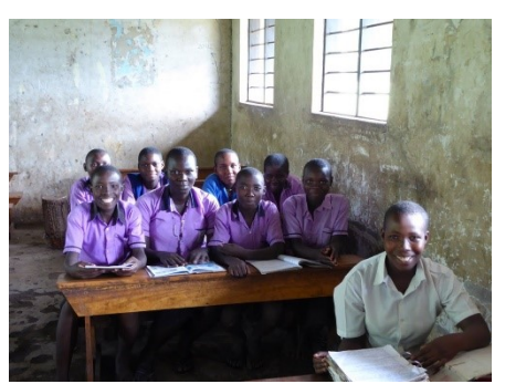
Rugaaga Primary 7 students