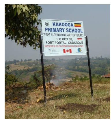
Signpost for Kakooga Primary School