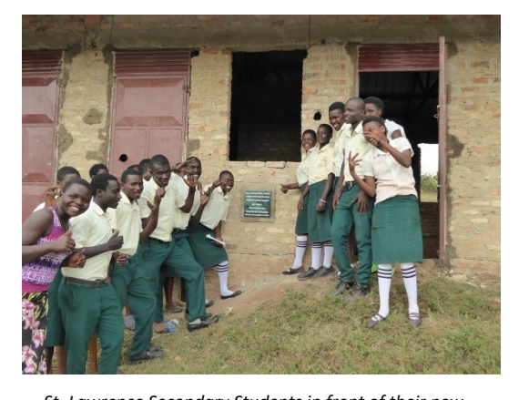
St. Lawrence Secondary Students in front of their new classroom