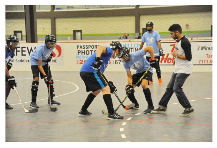
LBB University of Calgary Hockey Tournament